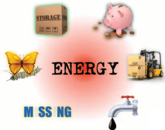
Fig. 1. Multiple metaphors for energy. Illustration by Punya Mishra. (© Punya Mishra)

stractions may miss details or overemphasize similarities. A solution to this would be to enrich concepts with multiple metaphors. For example, the concept of energy is fundamental across multiple science disciplines. In biology, energy is part of photosynthesis/nutrition, while in chemistry it relates to chemical bonds, and in physics it involves kinetic/potential energy. Students seeing the same idea within different disciplines may not understand these differences or connect multiple uses of the same word to its conceptual richness [21].