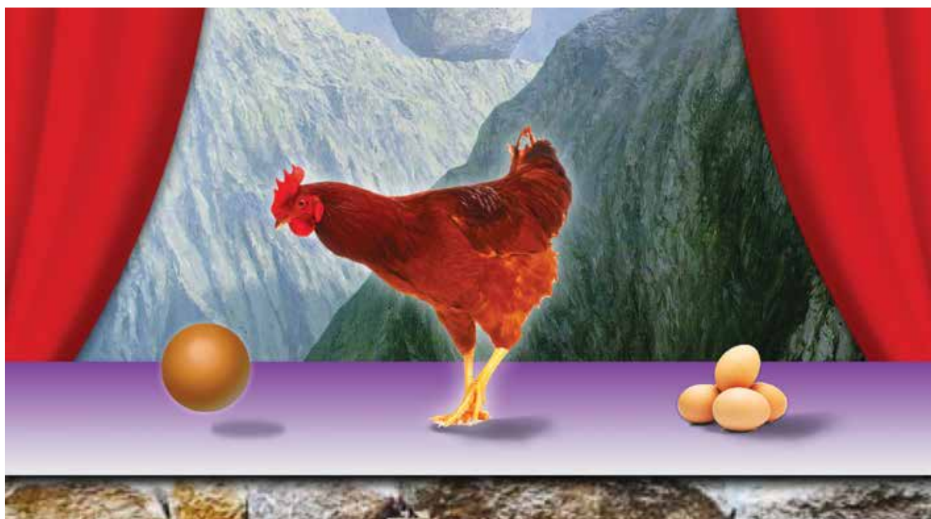
Fig. 1. The seduction of using single metaphors: using just one representation reduces the complexity of a rich idea.

We reason that such an approach hardly encompasses or conveys the underlying conceptual richness of this important and complex concept. In addition, students hear the same word in different classes or contexts, but are not provided opportunities to connect its seemingly