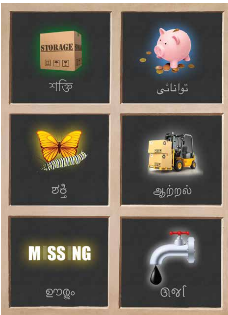
Fig. 2. The six metaphors for energy.

Of course, each of these metaphors, if used in isolation, leads to the distinct possibility that students develop a limited understanding of the nature of energy, and how it plays out across different scientific disciplines. It is here that the idea of weaving multiple metaphors together can help convey both the richness of the concept and prevent students from holding on to